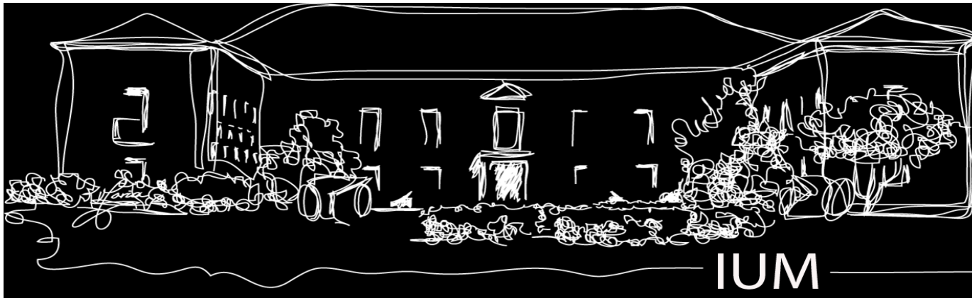
Military University Institute