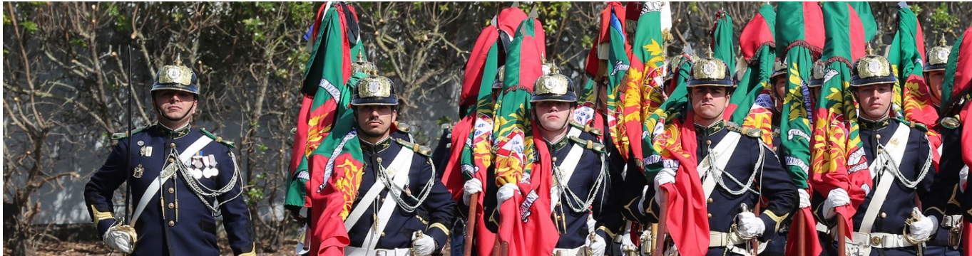
National Republican Guard